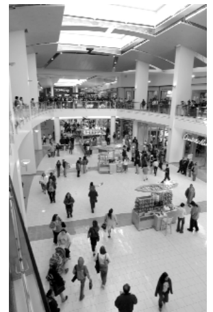
Shoppers take advantage of the new Shops at Tanforan .